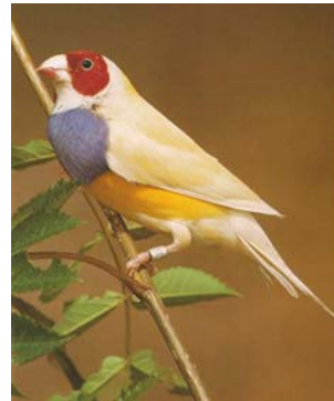
Gouldamadine Gelb (Mutation)